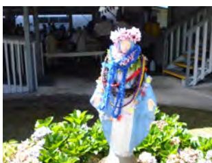
And for all who are sick